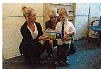
Local Community Scheme