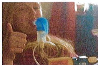
Help others take a breath