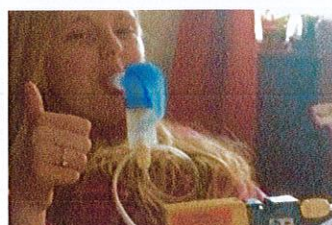
Help others take a breath