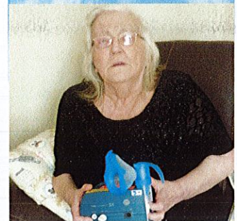
Care in the Community