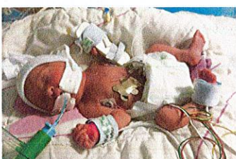
Supporting fragile life