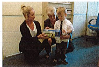
Local Community Scheme