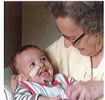
Help for all ages

Sometimes, all we need is the air that we breathe.