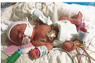
Supporting fragile life